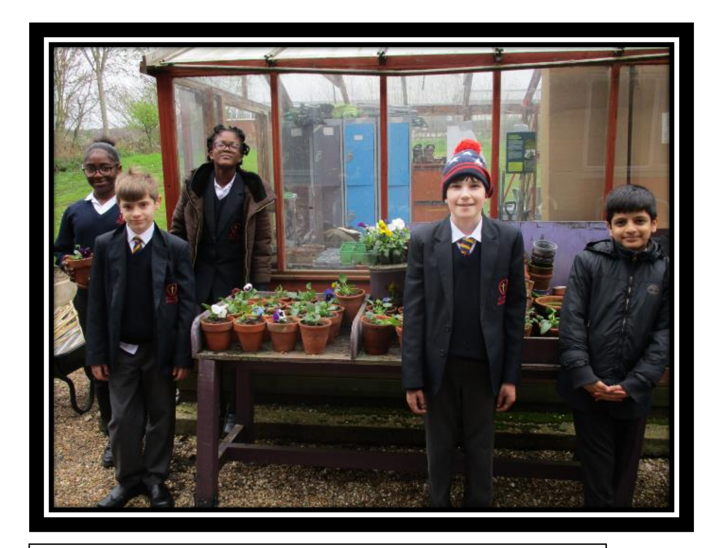
The gardening club – formed of Year 7 and 8 – with the completed flowerpots for Easter.