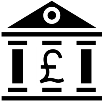
Finance & Banking Industry