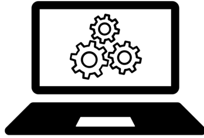
Technology & IT Industry