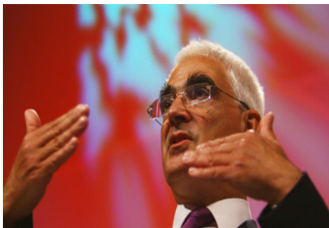
Chancellor of the exchequer Alistair Darling unveiling the plan in Downing Street.