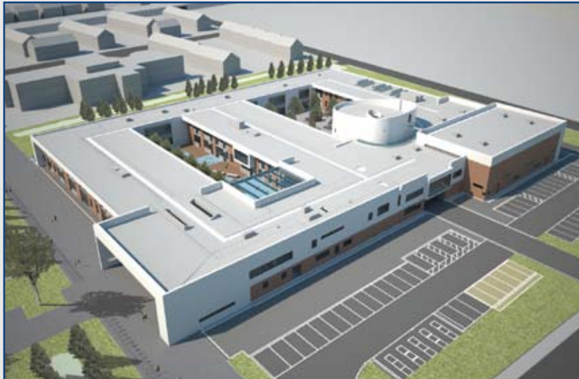
An architect's impression of the Abbey Wood Site.