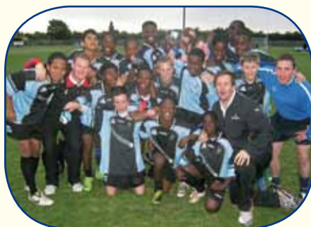
We are the London and All Britain Under 14 Gaelic Champions

Meanwhile, the boys' Gaelic Football team are also making themselves known. Over half term, twenty boys went on a seven day tour to Ireland, taking part in four fixtures and winning three. This was a particularly impressive result given that they played some of the most formidable teams in Ireland. Since their return, our Under 14 team have gone on to win the Great Britain Championship, and as with the girls, because of the team's success, ten boys were selected to represent South London in the Feile Peil na nOg competition which took place in County Kildare in July. Again, we wish them every success.