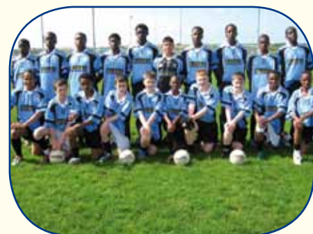
London Club Champions, All Britain Club Champions and All Britain Feile champions

The Girls' Netball Team continues to be very successful; the Year 7 & 8 Team recently won the Under 13 Greenwich Schools' Netball Tournament. They played every team and beat all of them apart from Eltham Hill, with whom they drew and who were the runners up. They were presented with the same shield that the current Year 10 won two years ago. Again, it is proudly positioned in the trophy cabinet!